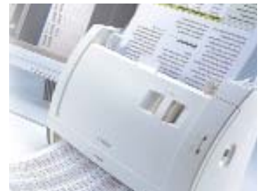
Reliable and Fast Document Capture

Bundled with CapturePerfect® 3.0, Adobe® Acrobat® 8 Standard, and OmniPage® SE 4, the DR-2050SP and DR-2050C devices become more than just scanners. They offer scanning options such as save, print, and e-mail-scanned images with one-click simplicity plus built-in OCR capabilities to make it easier to create searchable PDF files. Bundled with this latest document imaging software package, the DR-2050SP and DR-2050C scanners are small investments worth making.