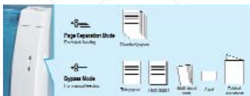
Page Separation or Bypass Mode Switch

The DR-2050SP/2050C color scanners incorporate Canon's renowned, high-precision roller system to help deliver smooth, jam-free feeding. Whether scanning single-page documents or multiple sheets of mixed document sizes and thickness, these Canon scanners offer uninterrupted performance with one of the most reliable feeding systems in their category. They even handle multipart forms with a simple flip of the Bypass Switch for convenient, non-separation feeding.